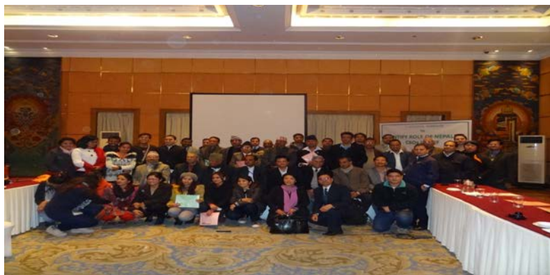
Participants in the Consultative Meeting with CSO