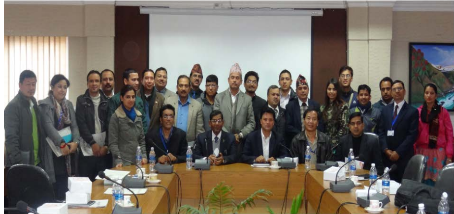
The Participants of the Workshop on Land Degradation and POPs Chemicals

The program started with the registration of the participants, followed by chairing of chairperson and introduction of the participants.