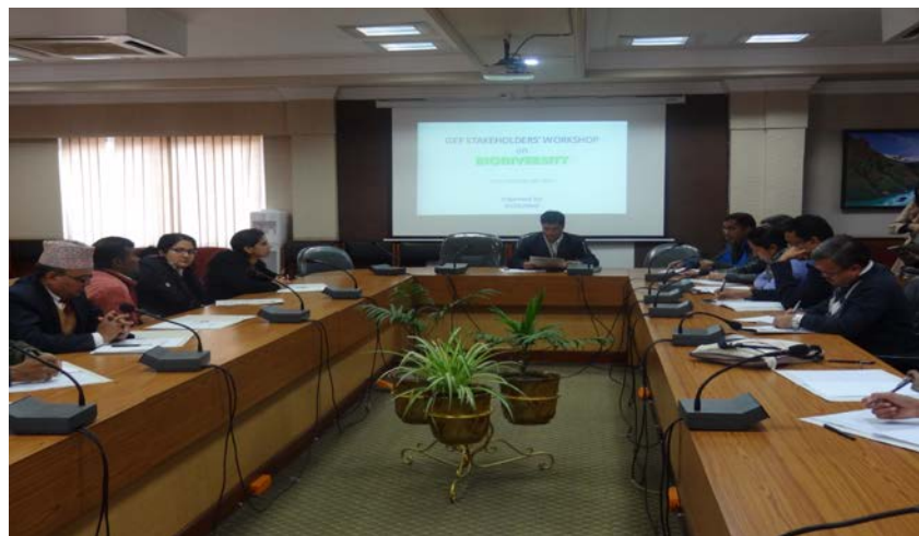
A Glimpse of the Workshop on Bio-diversity

GEF Workshop on Biodiversity was conducted on November 30, 2014. The major objectives of the workshop were to familiarize and summarize the operational experiences of biodiversity projects in Nepal; present