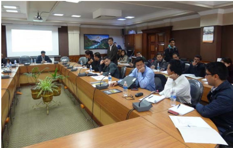
A Scenario of Climate Change Workshop Floor

GEF Workshop on Climate Change was conducted on November 28, 2014 in presence of the representatives of different ministries of Government of Nepal and GEF stakeholders. The major objectives of the workshop were to familiarize and summarize the operational experiences of climate change related projects in Nepal; present and discuss on the climate change issues for future plans and development; and recommend concrete suggestions through discussion and